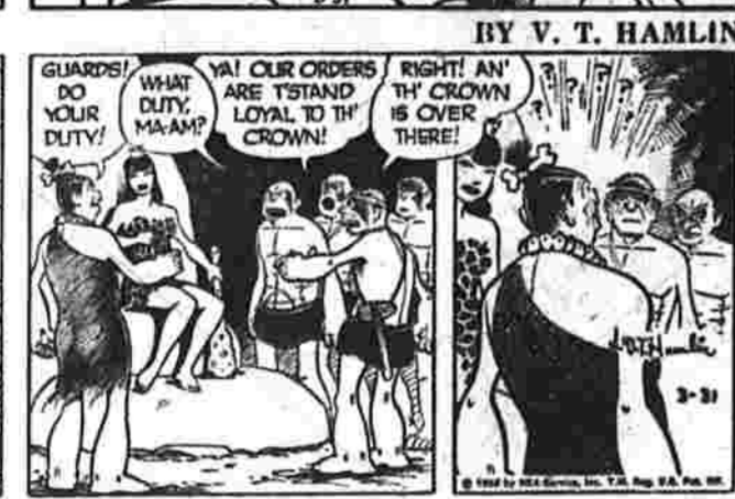
BY V. T. HAMLIN