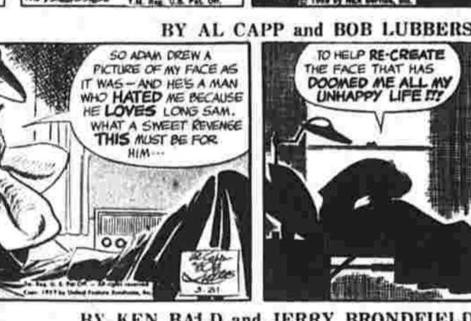
BY AL CAPP AND BOB LUBBERS