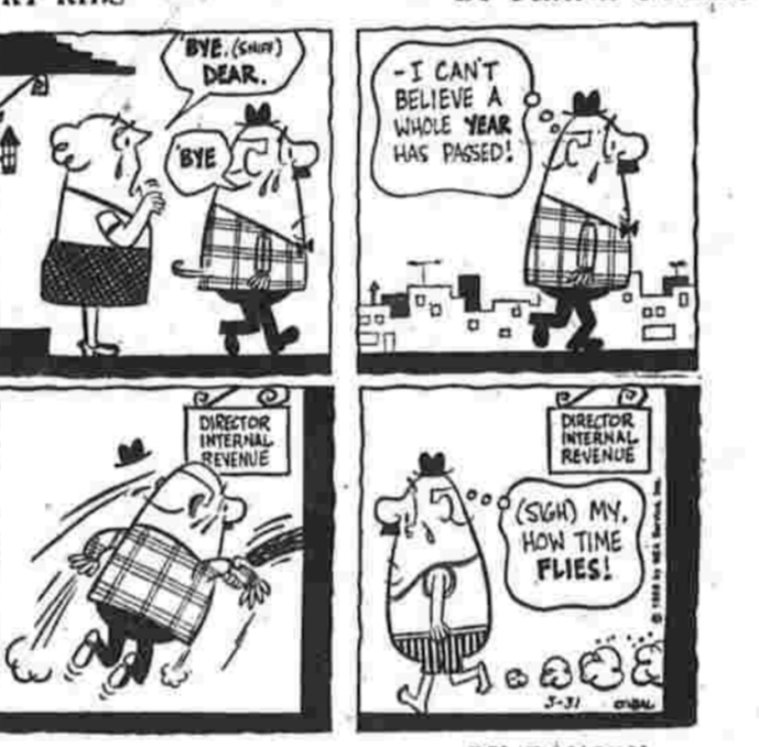
BY FRANK O'NEAL